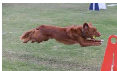
FIRST - S. Dwyer

Copper in full flight, ball held on to for dear life is a wonderful image that came second overall and also won the flyball category!