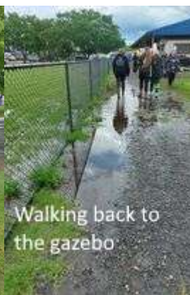
Walking back to the gazebo