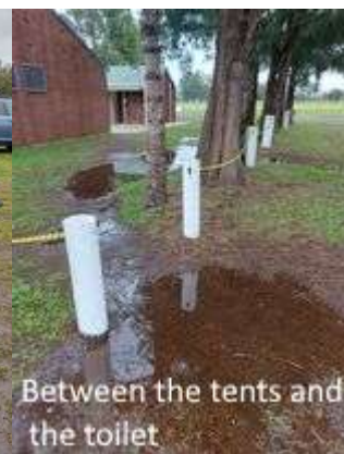
Between the tents and the toilet