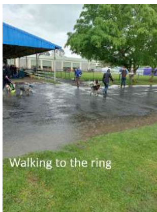
Walking to the ring

Some photos from Hawkesbury showgrounds, apparently it is completely underwater this week!