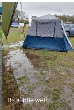
Its a little wet!