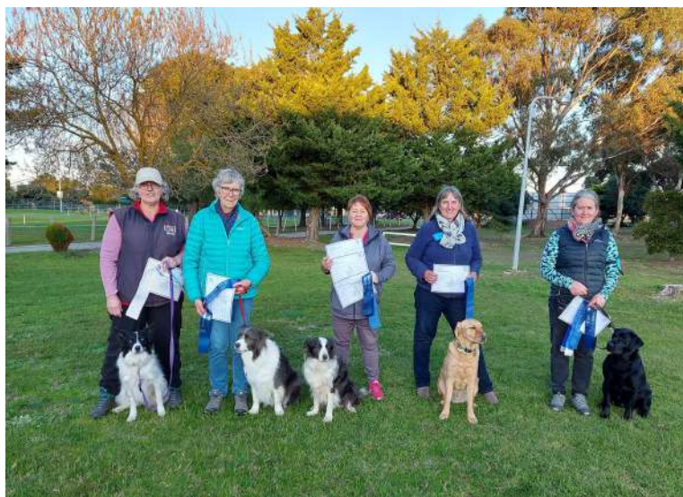
Our happy and proud Trick triallers!

There are more trials coming up in July, we wish all our members who have entered every success. Whether we get a pass, a place in the ring or 'it just wasn't our day', it is great to be able to celebrate or commiserate with other handlers and enjoy the day out with our dogs.