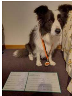
T Ch Nyanga ANZAC Silver Fern RE, CD, TSD

All these results were under the ANKC regulated trials Our apologies if we have missed anyone off this list. Please forward your results to Pat and she will make sure they are included in next month's edition.