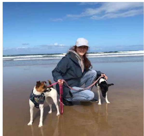
Yes, I did regret my choice of footwear